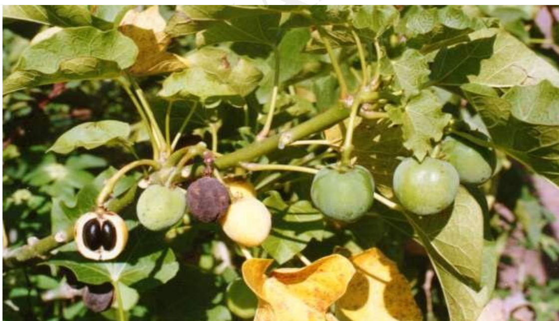
F-A: Intercropping of Jatropha with maize.

F B: The various stages of fruit development can be seen, and an open fruit shows the (black) seeds inside.