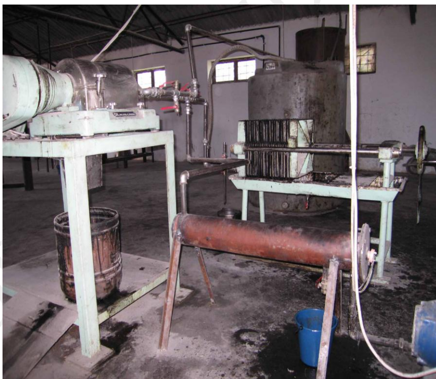
B: oil purification