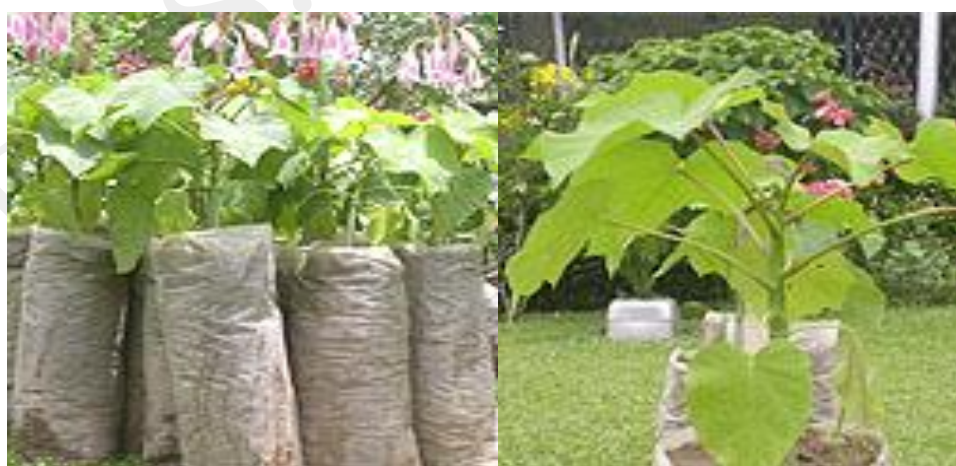
Supply of Jatropha sapling to farmers