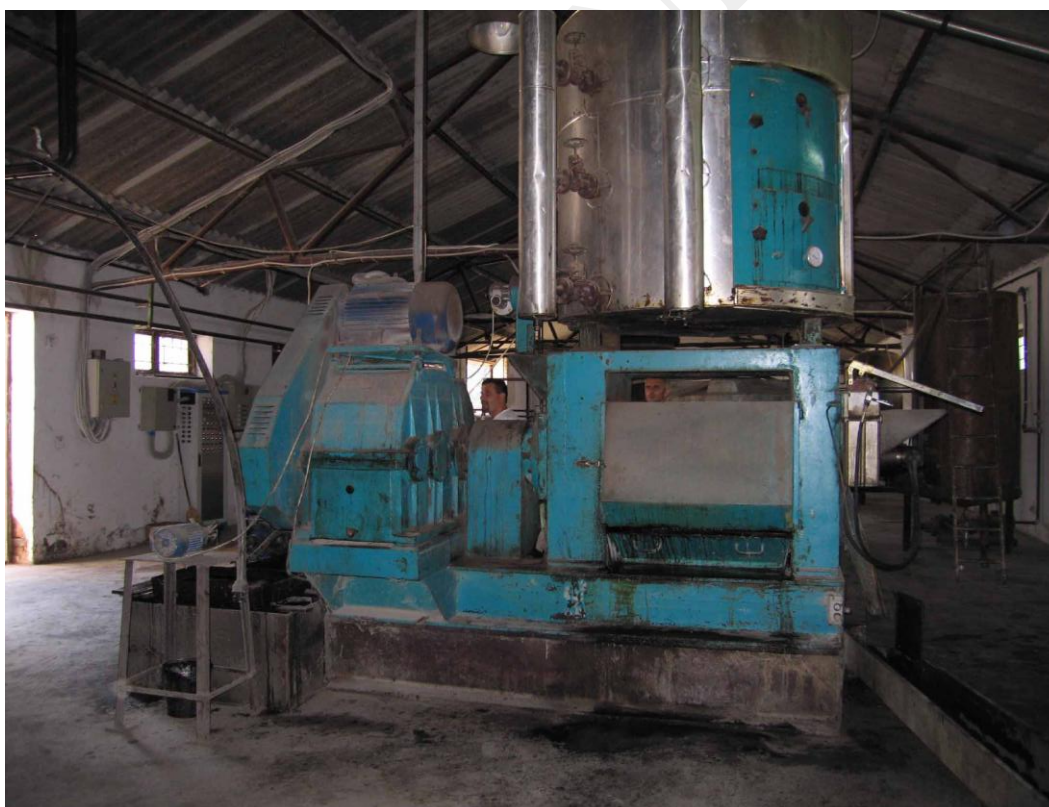
A: oil extraction

In the scenario of ever increasing petroleum prices in international market, Planning Commission, Govt. of India launched “National Mission on Biodiesel” with a view to find cheap and renewable liquid fuel based on vegetable oils. The report of “National Mission on Biodiesel” was submitted in the year 2003 identifying Jatropha (Ratanjot) as the proper oil-seed for extracting required vegetable oil for converting it into the biodiesel as a replacement to petrodiesel.