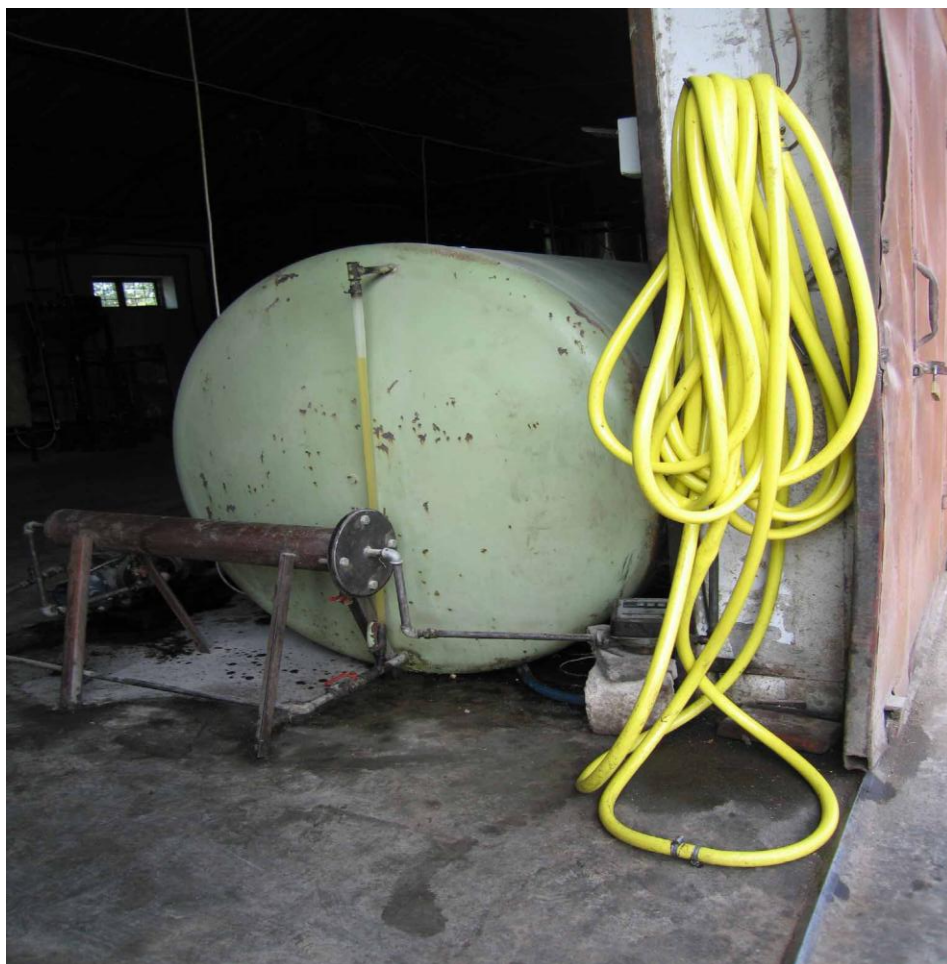
D: biodiesel tank